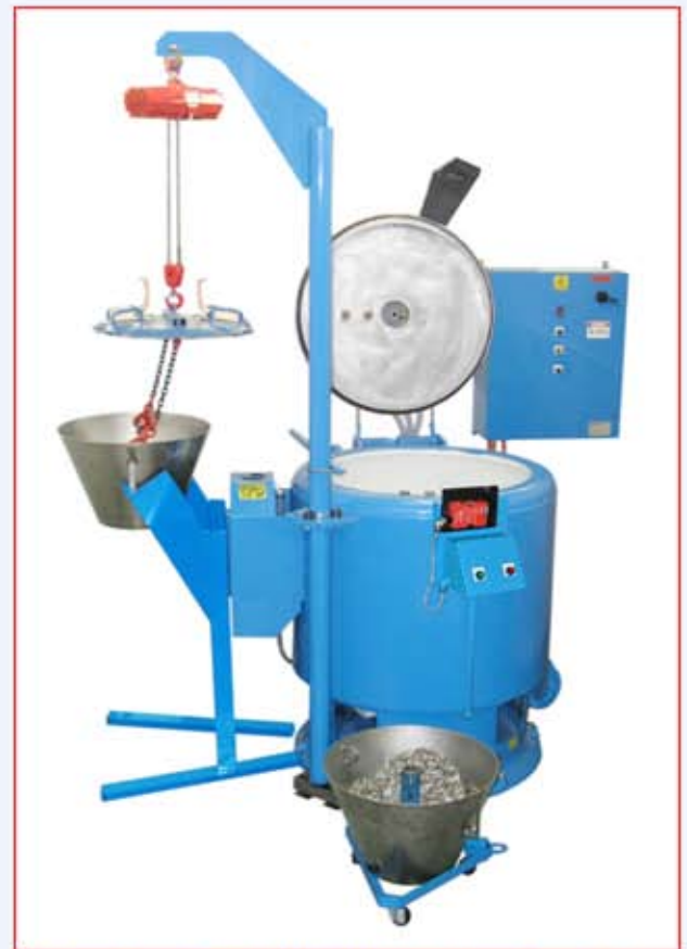
System shown with dryer unit and pan on standard dolly